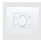
Controller TRIO LINEO 503 REF: 12891